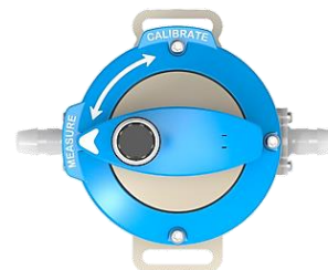
Top View with Dial Face