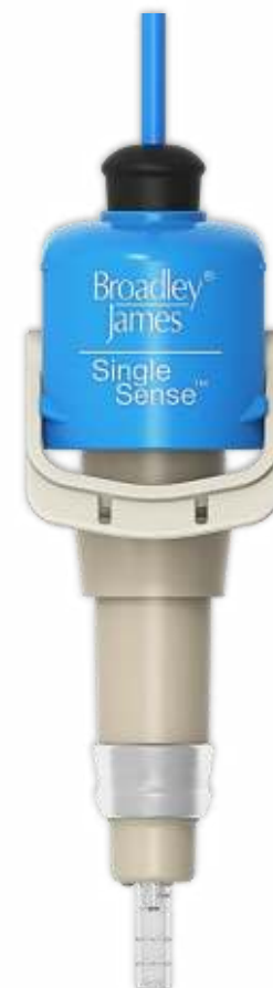
SU800-16-V8 Single-Use pH Sensor